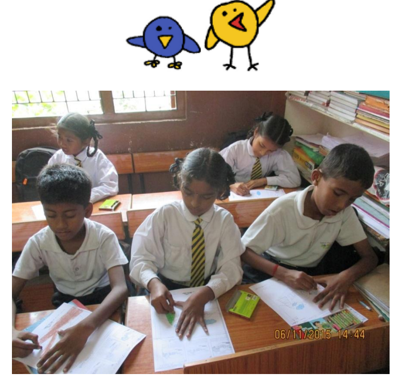
Art is a lot of fun in our 4<sup>th</sup> grade!