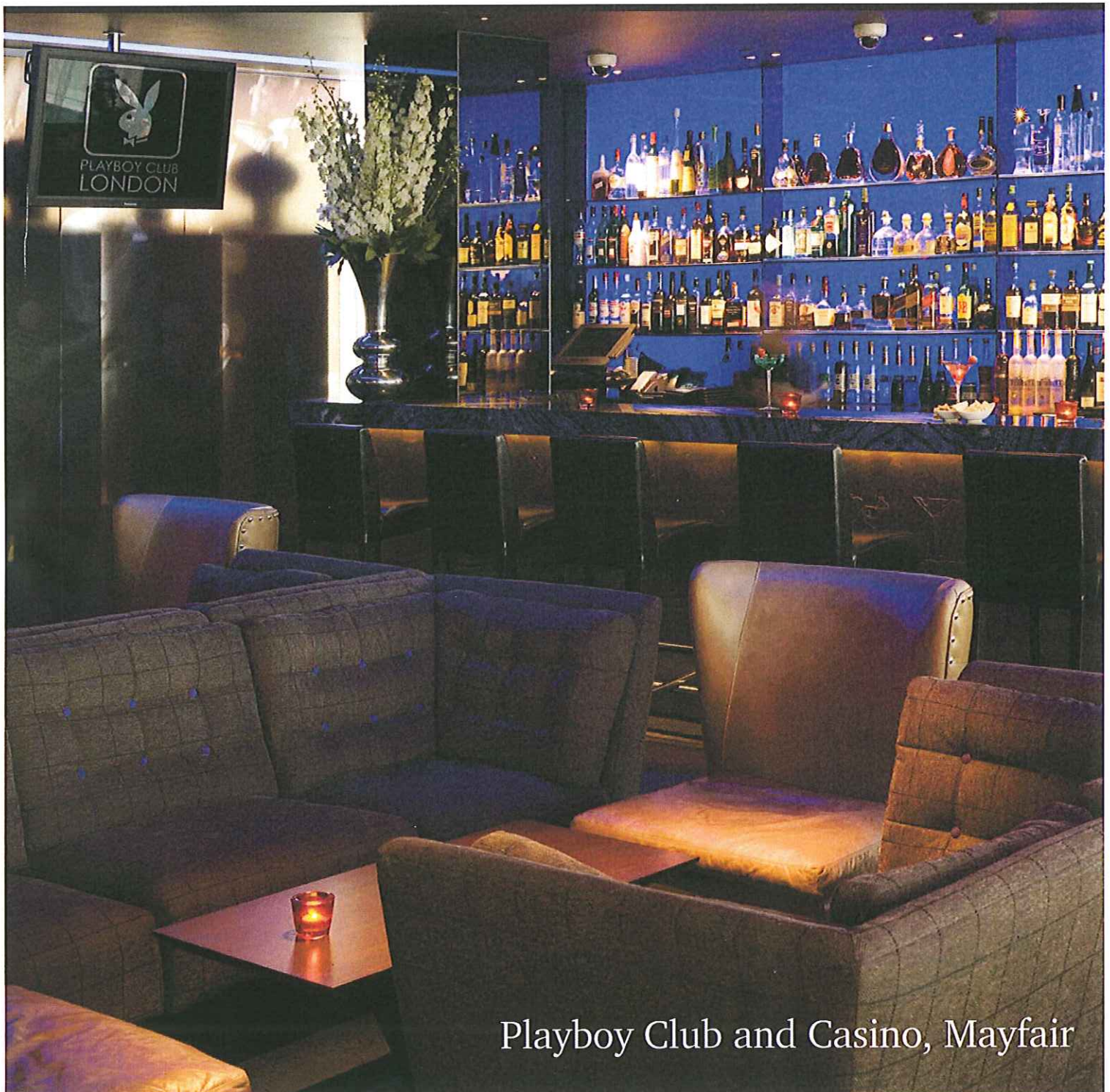
Playboy Club and Casino, Mayfair