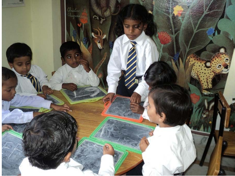
Teachers' day at Soham for Kids School.

5 th September: Teachers Day was celebrated at Soham for Kids in remembrance of our late President Dr. S. Radha Krishnan. Children actively participated by monitoring the school activities on Teachers' day celebration.