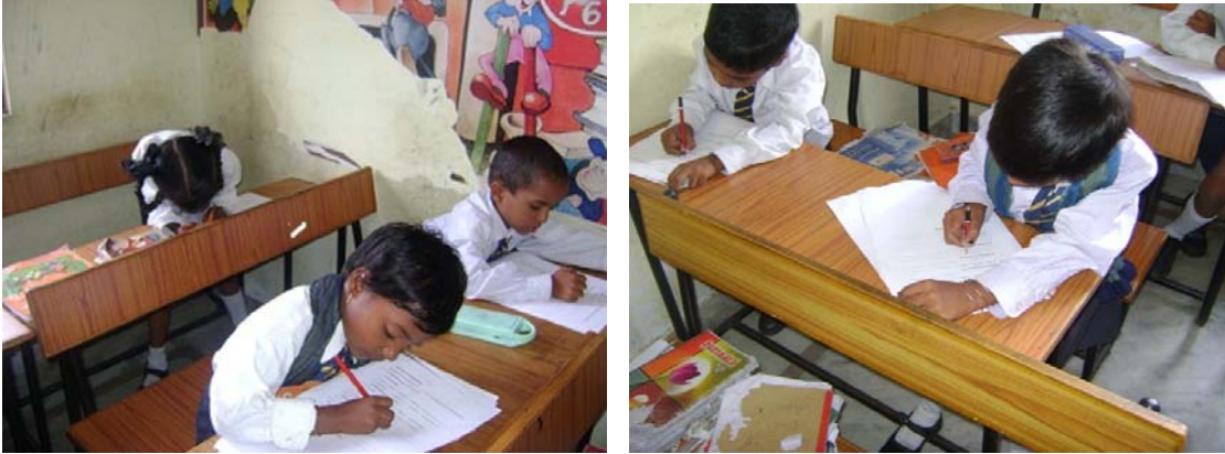
Children seen writing their quarterly examination.

Soham for Kids School faced its 1 st term examinations which started on 19 th of September for all the classes.