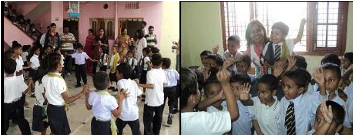
Bank of America's staff spending some quality time with the children.

Volunteers from Bank of America visited Soham for Kids on the 23 rd of September, 2011